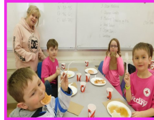
DAY OF PINK