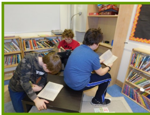
I LOVE TO READ