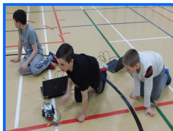
GRADE 5/6 ROBOTICS