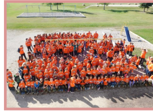
ORANGE T-SHIRT DAY