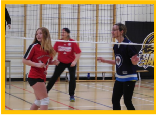
STAFF STUDENT VOLLEYBALL