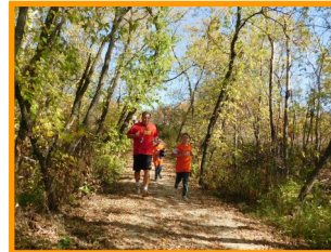
TERRY FOX RUN