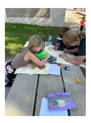
½ Kurnell learning how to "leaf smudge"

The grade 3/4 class is learning about the system of our government and why we are having an election on Oct. 3<sup>rd</sup>.